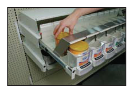
Stock the Merchandiser with Infant Formula cans in the appropriate modules.